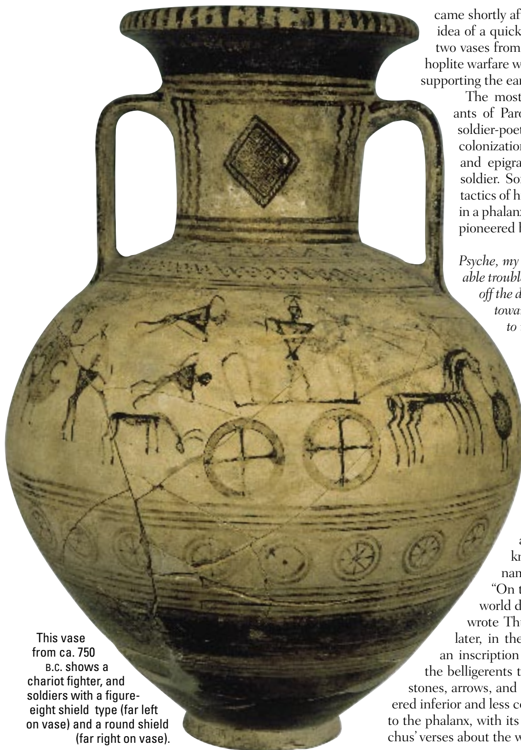
This vase from ca. 750 B.C. shows a chariot fighter, and soldiers with a figure-eight shield type (far left on vase) and a round shield (far right on vase).

came shortly afterward, which further discredits the idea of a quick, revolutionary change. But now, the two vases from the Paros tombs offer evidence that hoplite warfare was established by about 730, possibly supporting the earlier explanation.